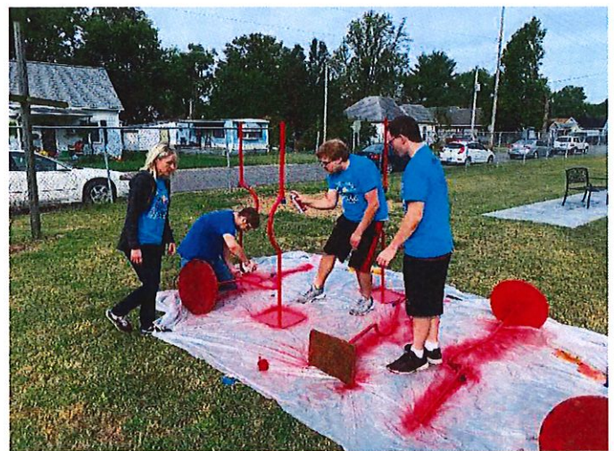
Business students paint bell ringing posts for Salvation Army during the annual Day of Caring.

Payment is due when ordered and we accept Cash, Check, and with a Debit or Credit Card you can order over the phone at 812-882-2285