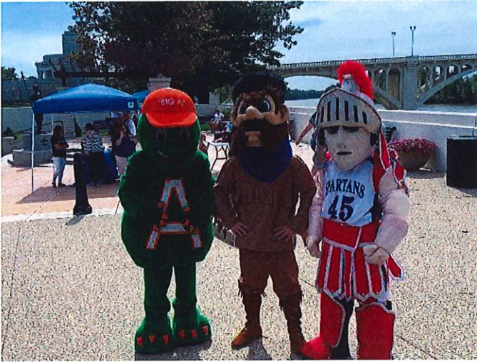
A first at the Annual kickoff as mascots from 3 different schools gather to help kids celebrate.