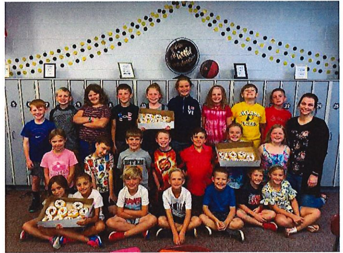
One of the Winning Classrooms in the coin challenge that resulted in donuts for the kids.

Next quarterly meeting of the Task Force will be Tuesday December 3 rd at 9:00 at Helping His Hands. Public is invited to attend and become involved.