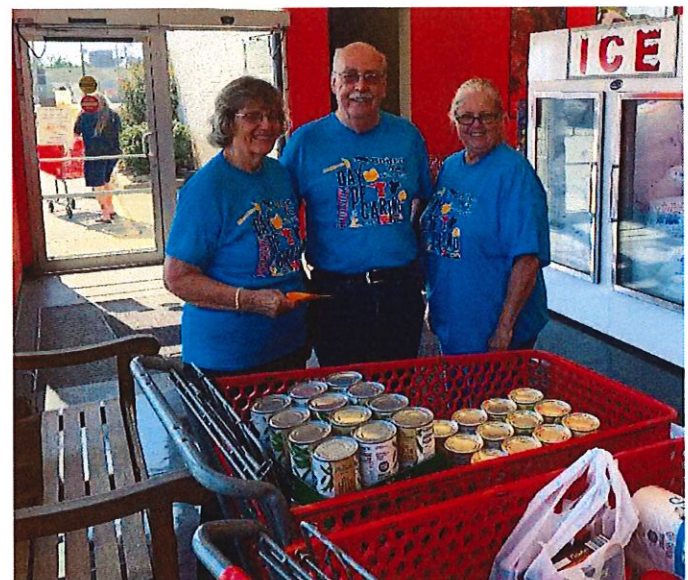
Volunteers at Save-A-lot collect for area food bank