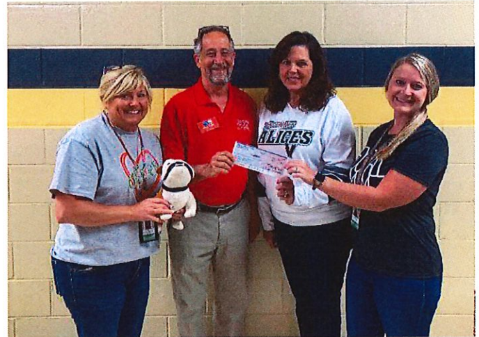
Vigo Elementary teachers and principal accept money to support the K-3 tutoring program