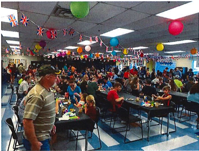
Large crowd of employees and visitors to Futaba open house in support of United Way.

Beyond making an impact on our future and in the lives of others, this evening will be an opportunity for fun and fellowship with friends. We pray God will lead you to join us in our cause to help those in desperate need.