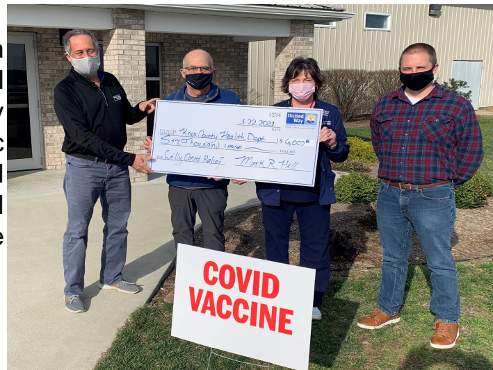
Check presentation to Knox County Health Covid Clinic

https://www.unitedwayofknoxcounty.org/knox-county-united-covid-19-economic-relief-initiative