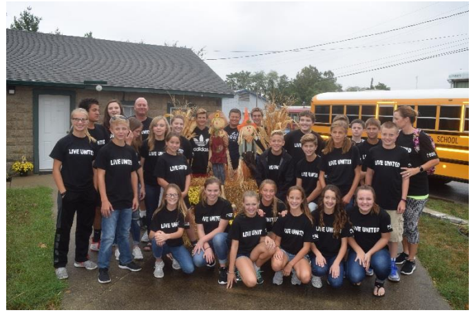
South Knox Middle School Students prepare to clean up Hart St. during the annual Day of Caring.

Mark your Calendar – Special salute to Veterans is scheduled for Sunday November 12<sup>th</sup> at 2:00 in the North Knox Auditorium. Free Will donations to the United Way are welcome.