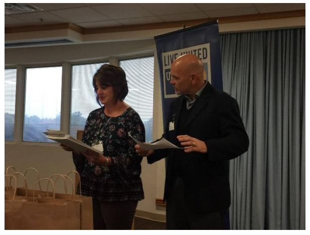
Awards were handed out to various Good Samaritan Departments who met or exceeded their campaign goals.